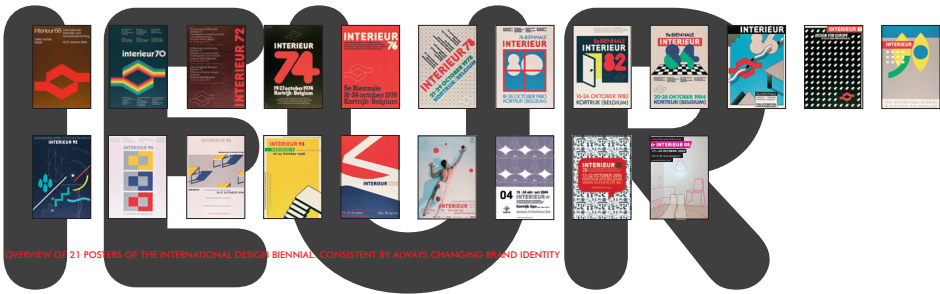
OVERVIEW OF 21 POSERS OF THE INTERNATIONAL DESIGN BIENNIAL CONSISTENT BY ALWAYS CHANGING BRAND IDENTITY

The sense of the impossible excited the founders of the INTERIEUR FOUNDATION, (Belgium) in 1967. Giving VISIBILITY TO NEW DESIGN for the home and INNOVATIONS for the interior to a broad general public and not only to professionals as most fairs do, was one of the goals. Create a space and atmosphere that does not obey the laws of traditional lay-out and stage design where WORLD DESIGN BRANDS take the floor, is the target. The UNIQUENESS of the CONCEPT and the increase over the years of turnover, number of visitors, number of participants & brands, press articles etc. show that this innovative model was needed for DESIGN COMMERCE towards a BROAD PUBLIC.